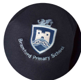
Branding & Logo Embroidery