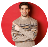
Stylish Thread Combinations